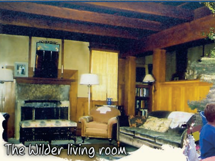
The Wilder living room

In 1932, Laura Ingalls Wilder published the first of her beloved "Little House" books, which described the pioneering of the Ingalls and Wilder families during the 1870's - 1890's. All of the nine manuscripts for these famous books were penned right here on Rocky Ridge Farm. Their publication made the Wilders well-known international literary characters.