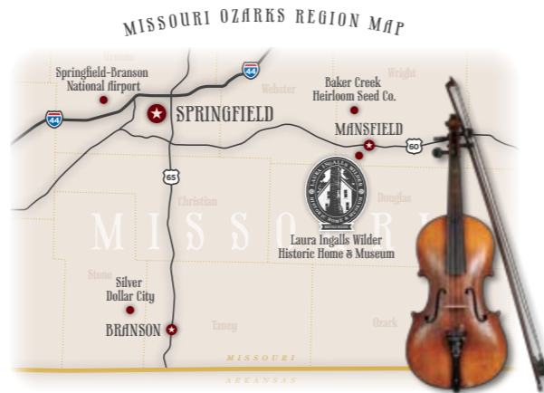
The Missouri Ozarks Region is a thriving vacation destination for those seeking Midwestern Americana experiences. The Springfield-Branson National Airport attracts approximately 800,000 passengers each year, and Branson Missouri attracts 7 million visitors every year (2 million more than the Grand Canyon).

The Laura Ingalls Wilder Home Association of Mansfield, Missouri has undertaken extraordinary challenges attending to the restoration, preservation and education of Laura's legacy. The association's passionate attention to detail and diligent efforts are ensuring that these priceless treasures will be available for future generations.