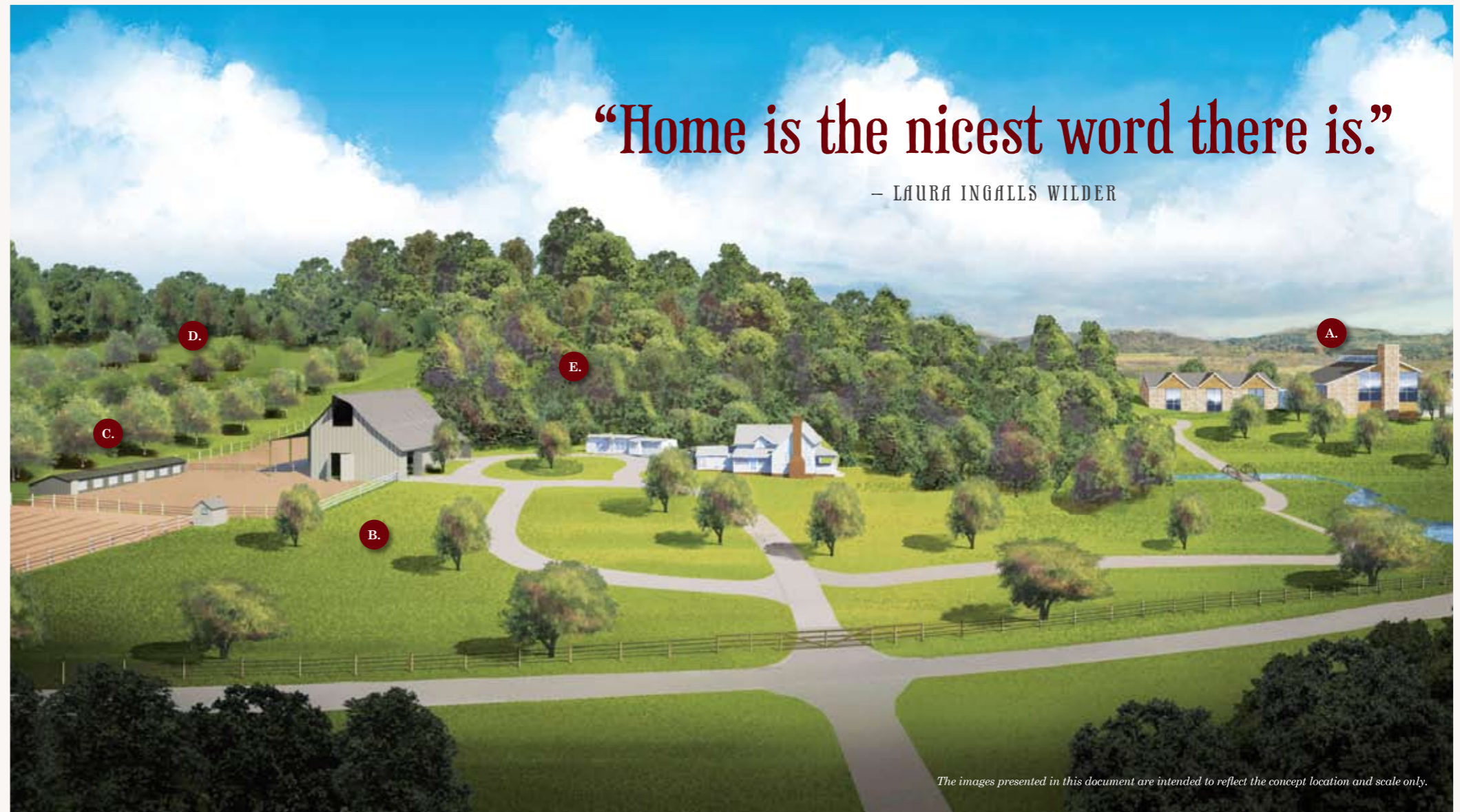
The images presented in this document are intended to reflect the concept location and scale only.

"As a youngster during the Great Depression, I used to ride my rusty old Ranger bike out 60 Highway to the Wilders' home to deliver Colliers and Country Gentlemen magazines. Outside of kinfolks, they and Rose were about my only regular paying customers. To this 8-year-old, they were always just mighty nice folks."