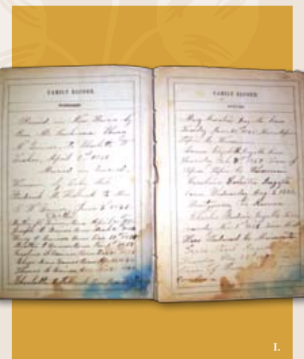
Pictured above: A.) Little House on the Prairie, 1st edition, 1935, Helen Sewell illustrations, B.) Laura's 22 caliber revolver and Pair of black dress gloves, C.) Little House in the Big Woods, 2nd edition, 1953, Garth Williams illustrations, D.) Rose Wilder Lane's Underwood typewriter, E.) Laura's jewel box, F.) Laura's Blue Willow China G.) Handwritten thank you note from Laura, circa 1954, H.) Pieces of Rose's pottery, I.) Ingalls Family bible open to the family history