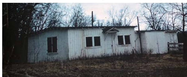
Wilder Outbuilding circa 1958